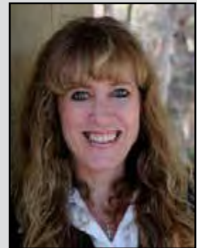
Eagle Springs Resident