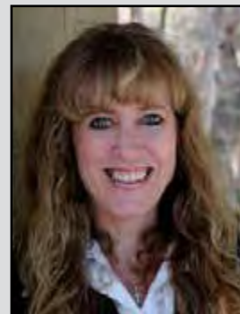
Eagle Springs Resident