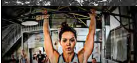
Sport Specific Training & Personal Training