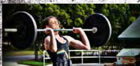
Teen Strength & Conditioning Programs