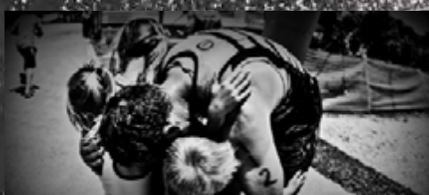
Young Athletes Class (6-10 years)