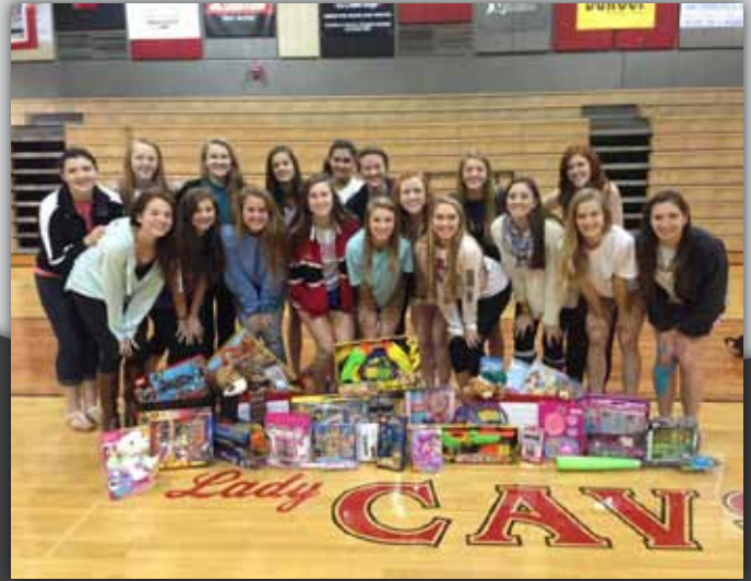
Members of the LTHS Lady Cavs freshman, JV and Varsity basketball teams donated 100 gifts to Lake Travis Green Santa through LTlov.