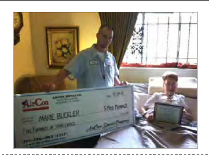
**Enter Now!** ANOTHER FREE FURNACE in Feb. 2013!