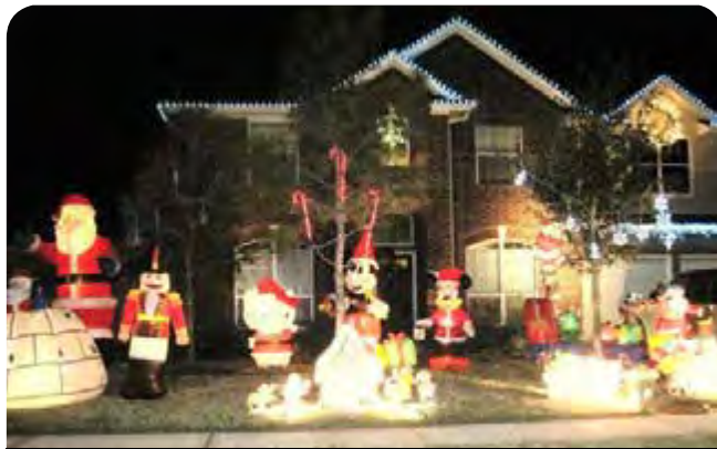
THE CRENWELGE FAMILY OF BREEZY MEADOW LN

They will each have a "Yard of the Month" sign displayed in their yard for the month of January, and will also receive a $50 gift card to Lowe's!