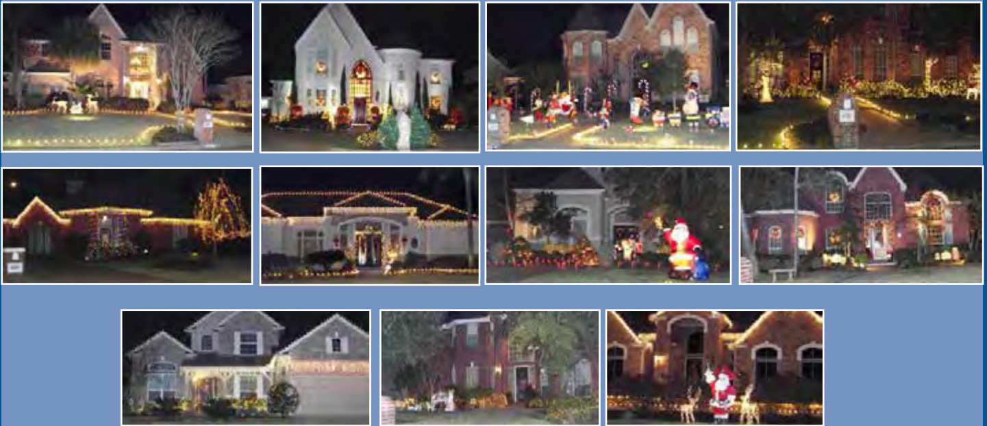
YOM Holiday Honorable Mention photos (Continued from Page 6)