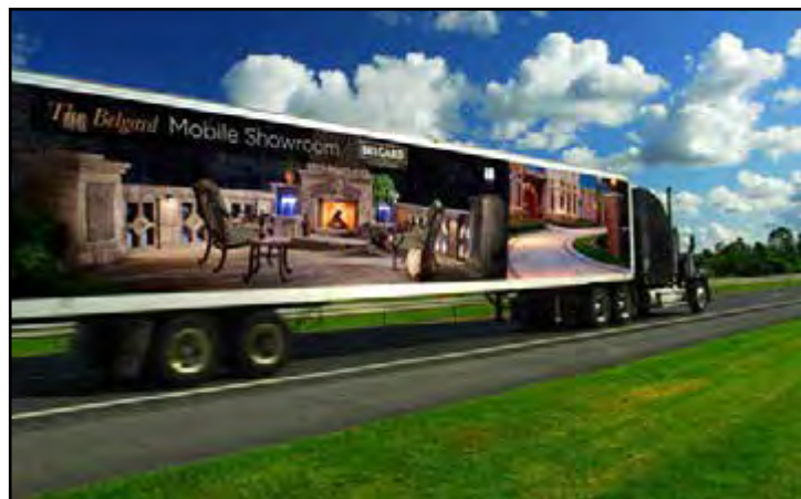
The Belgard Hardscapes Mobile Display, a semi truck filled with ideas to create the picture-perfect patio, will be featured at the Cy-Fair Home & Garden Show.

Creative ideas to transform a backyard into a relaxing oasis can be found at the Custom Outdoors Inc. booth, added Wood. Then complete the picture with assorted fruit trees and gardening containers and enjoy special discounts at the RCW Nurseries, Inc.