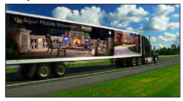
The Belgard Hardscapes Mobile Display, a semi truck filled with ideas to create the picture-perfect patio, will be featured at the Cy-Fair Home & Garden Show.

"In addition to the more than 200 exhibitors, we have an excellent lineup of speakers that are well known, enthusiastic and have a wealth of experience - just what it takes to get you started on the right track with your home improvement projects," added Wood.