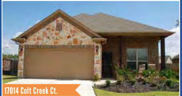
17014 Colt Creek Ct.