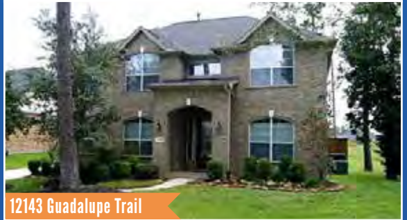
12143 Guadalupe Trail