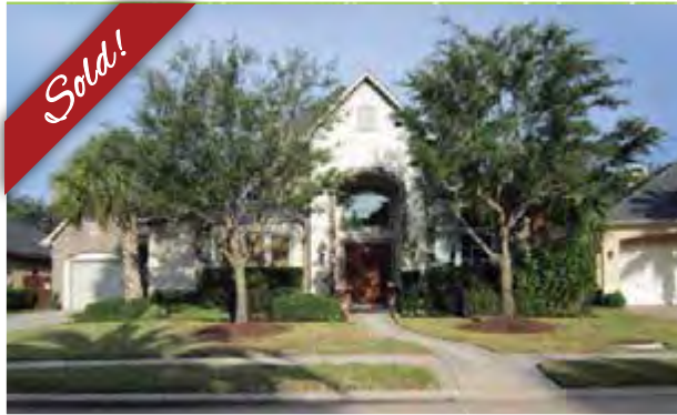
5511 CARDINAL BAY