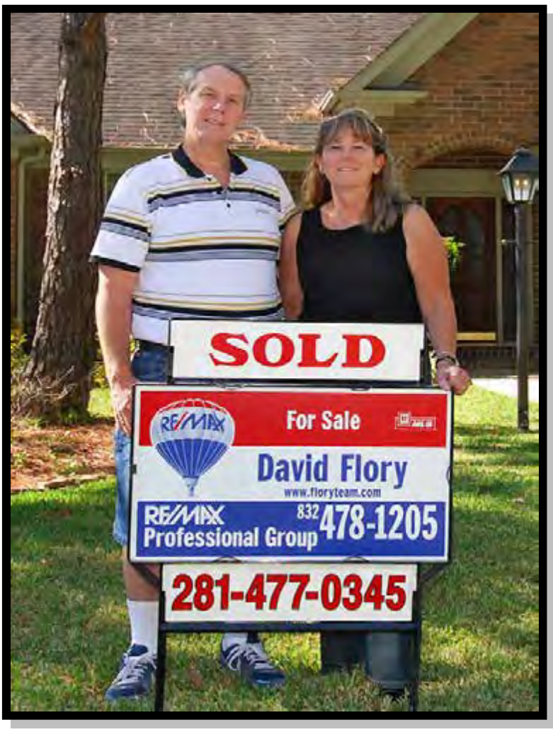
Each Office Independently Owned and Operated

Over Thirty Years Experience Delivering Unsurpassed Customer Service!