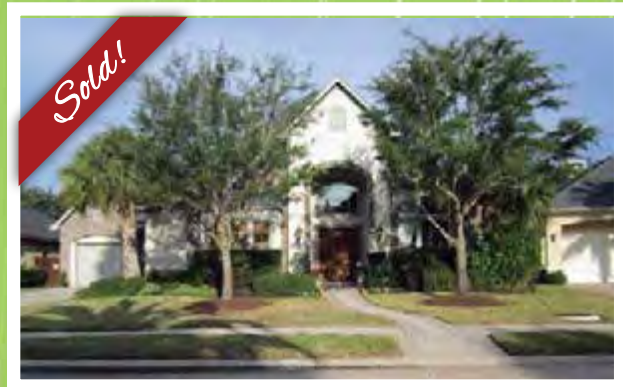
5511 CARDINAL BAY

We are pleased to announce that Karen recently participated in the sale of 5511 Cardinal Bay in Lakes on Eldridge.