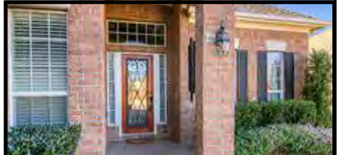
9111 Lake Lewisville

Coles Crossing Very pretty Trendmaker, open floorplan