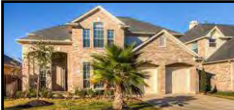
17906 Sugarloaf Bay