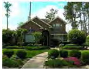
14803 Cantwell Bend