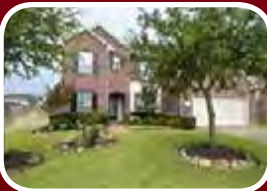
Sale Pending MLS # 61431707 4BR/3.5Baths/2 car garage 2710 Catalina Shores Dr.