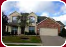
COMING SOON TO THE MARKET Gorgeous Newmark Home 4/3.5/2 Formal dining, study, gameroom on large lot!