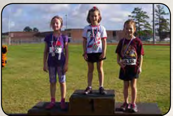
K - 2nd Girls