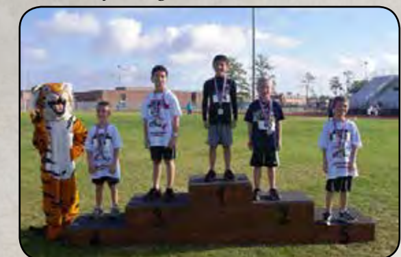
K - 2nd Boys