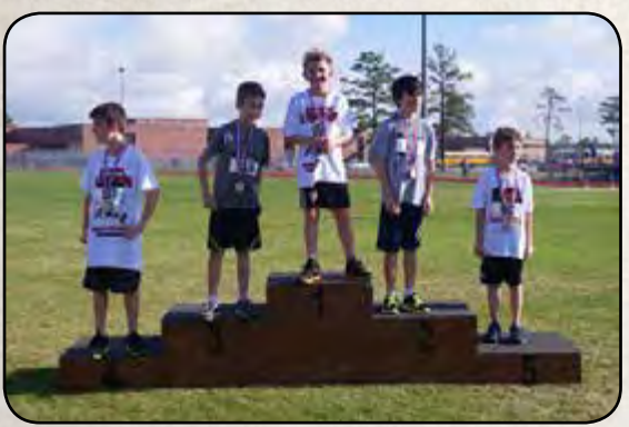
3rd - 4th Boys