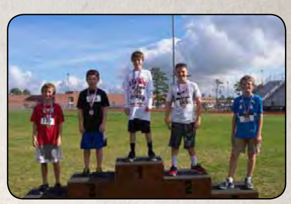
5th - 6th Boys