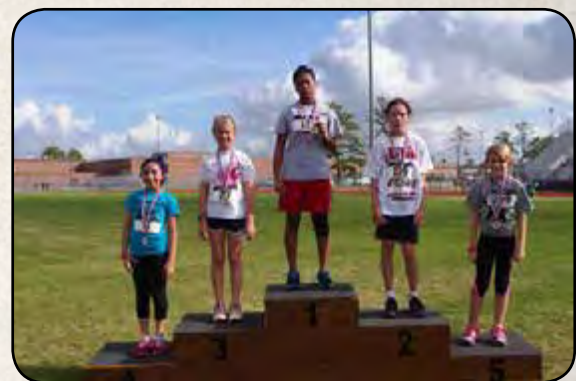
5th - 6th Girls