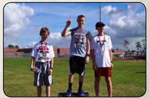
7th - 8th Grade