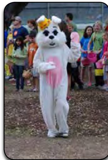
The Easter Bunny was excited to see so many neighbors at Perry Park!