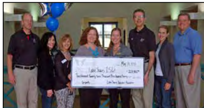
Lake Travis Education Foundation Prize Patrol members present a check to Lake Travis ISD representatives for grant funding for all campuses.

The directors of the Lake Travis Education Foundation encourage all members of the community to make a direct impact on the future of children throughout the Lake Travis Independent School District by partnering with LTEF. Established in 1985, the Foundation has supported LTISD schools and students with over $3 million in grants and scholarships. For further details and a complete listing of awards, visit www.LakeTravisEducationFoundation.org .