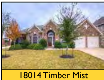
18014 Timber Mist