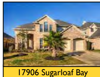
17906 Sugarloaf Bay