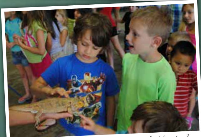
Hundreds of children got up close and personal with animals including this lizard.