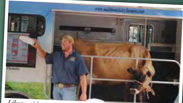
Library visitors got meet a real dairy cow in a visit by the Mobile Classroom and "Belle" of the Southwest Dairy Farmers.

Visit the library website http://pl.beecavetexas.gov for more information or call 512.767.6620. Bee Cave Public Library is located in the Hill Country Galleria, at the intersection on Highway 71, Ranch Road 620 and Bee Cave Road (FM 2244).