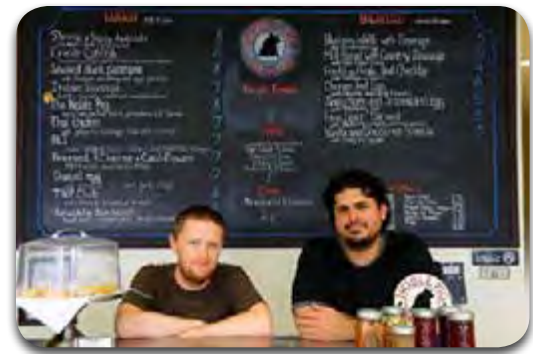
Noble Sandwiches Central is on schedule to open this fall at 4805 Burnet Road.

mouthwatering sandwiches! And if award-winning sandwiches weren't enough, the central location will stay open later than the northwest outpost, serving beer, wine and charcuterie including specials during a 5 p.m. to 7 p.m. happy hour. According to their Facebook page, Noble Sanwiches Co. will open this fall.