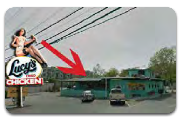
Lucy's Fried Chicken will open this fall in the former Austin Diner location at 5408 Burnet Road.