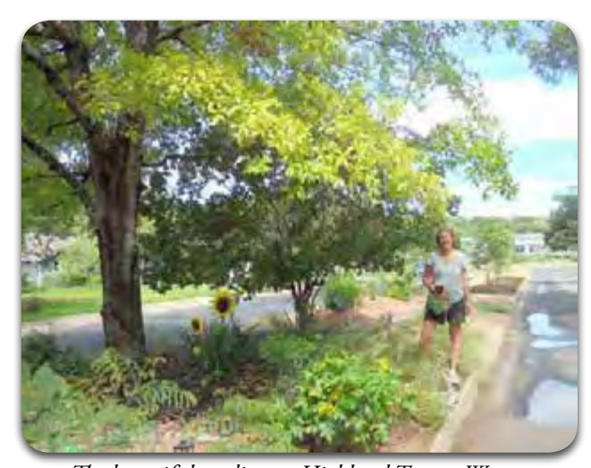
The beautiful median at Highland Terrace West.

Many, many thanks go out Colleen and all those who helped make Highland Terrace West median so lovely.