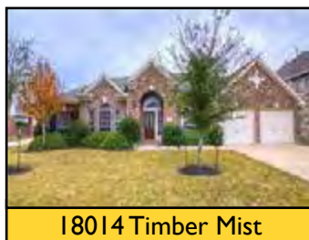
18014 Timber Mist