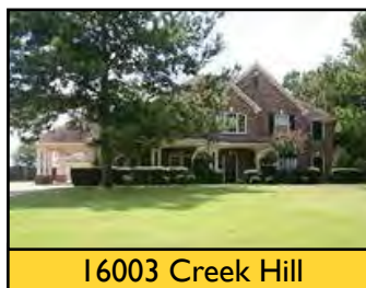
16003 Creek Hill