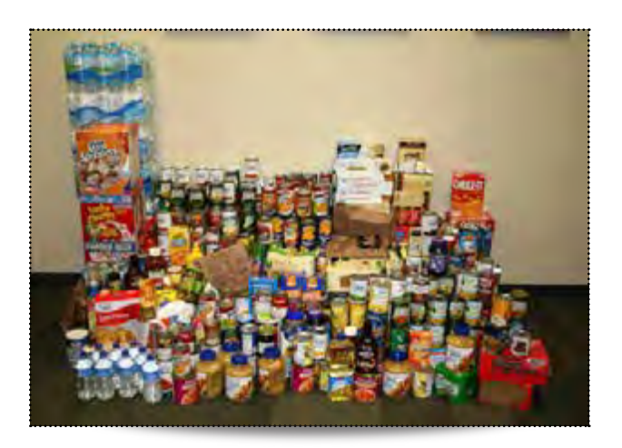
The results of a food drive run by Cypress Woods Key Club to help the less fortunate in the Cypress area.

Cypress has lots of volunteering opportunities during the summer, and for any Key Club member looking to catch up, keep up, or get ahead on their hours, they don't have to look far to find service opportunities that fit them.