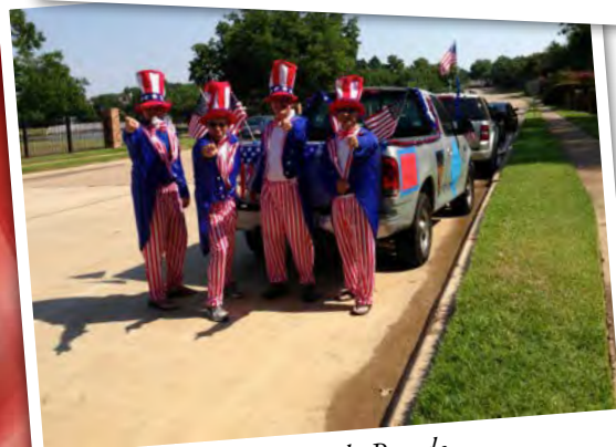
Fourth of July Parade