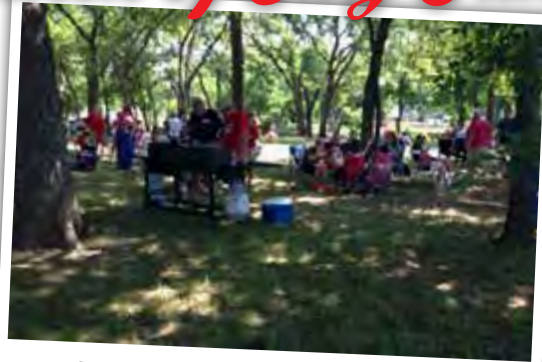
Fourth of July Picnic in Melrose Park.