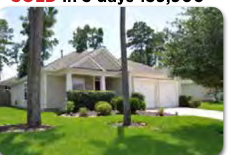
12230 Grand Portage