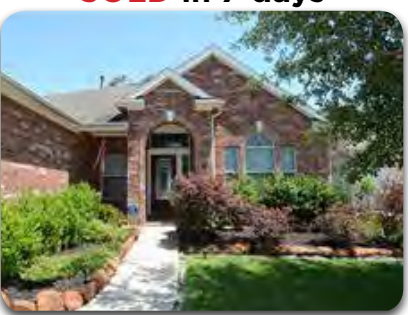
17606 Sierra Creek