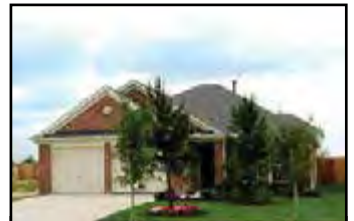
20626 Mauve Orchid Way