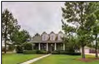
16615 Cottage Rose Tr