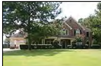
16003 Creek Hill