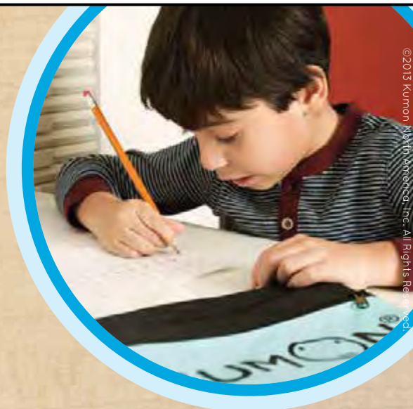
©2013 Kumon Math & Reading Center, Inc. All Rights Reserved.