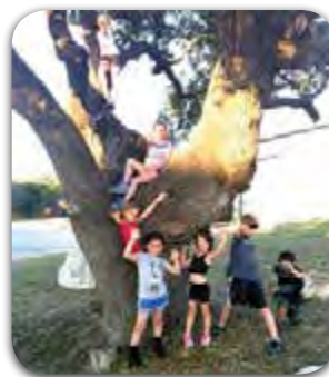
Nationally recognized Cheer & Tumble Program