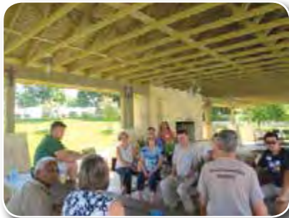
General overview and Q&A session

Thank you to all of the new Avery Ranch residents that took the time to join us.