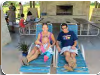
The Gardeners take a moment in the shade