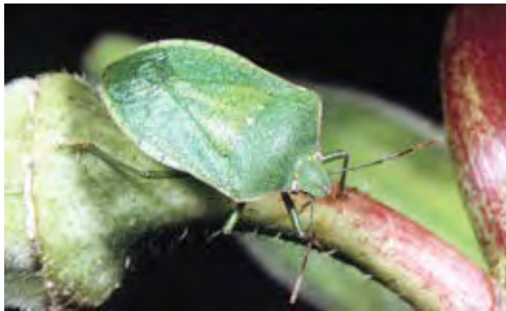
SOUTHERN GREEN STINK BUG

Similar in appearance, but not to be confused with stink or shield bugs, are the leaf-footed bugs belonging to the superfamily called Coreoidea. Also particularly active in the fall, these bugs are about 3/4 inch in length, and dark brown with a whitish to yellowish stripe across the central part of the back. Their hind legs have flattened, leaf-like expansions on their tibia. In Central Texas, adults are often found feeding on the joints and fruits of prickly pear cactus.