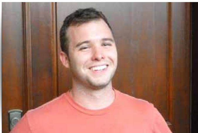
Reed on Holly Fern Cove