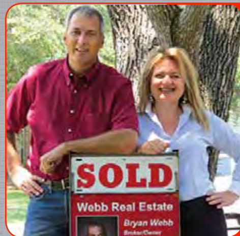
The Broker You Can Trust

Proven successes with over $60 million in closed transactions