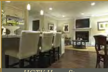
HGTV Home Stager

The marketing our team does for your home cannot be natched. From online listings to print and email strategies we get you the most for your home.