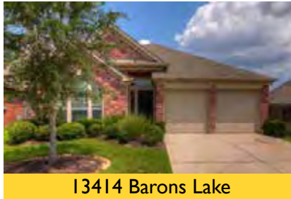
13414 Barons Lake

Lakes at Northpointe • Pristine 1 Story $179,900