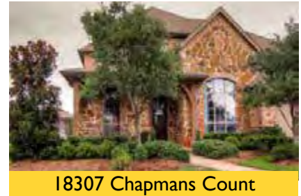
18307 Chapmans Count

Lakes at Northpointe • Pristine 1 Story $179,900