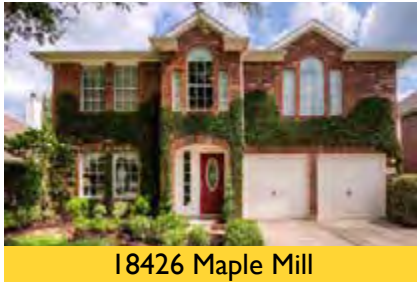
18426 Maple Mill