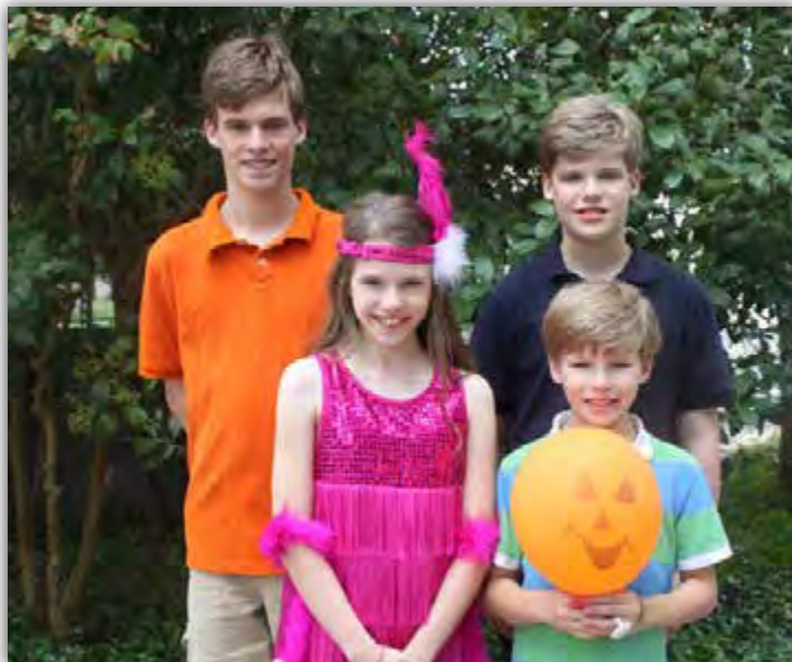
Thanks to our Jester volunteers!