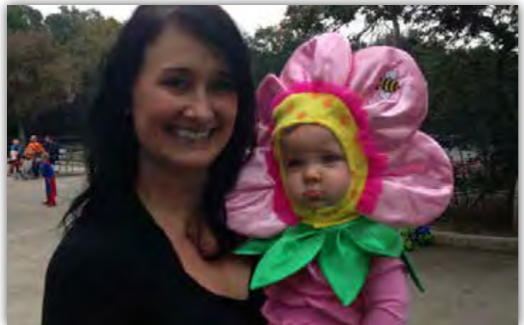
(Halloween Parade Photos - Continued on Page 6)