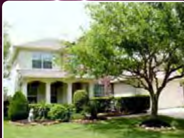
12139 Canyon Arbor Way ..... SOLD .....