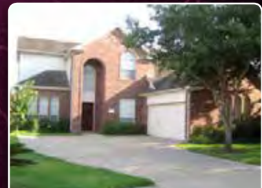
12003 W. Canyon Trace Dr. ..... ACTIVE .....