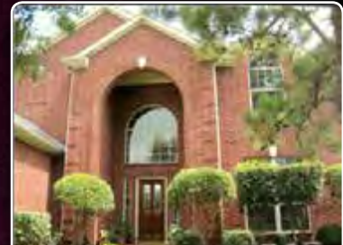
16611 Lost Mill Dr. ..... ACTIVE .....