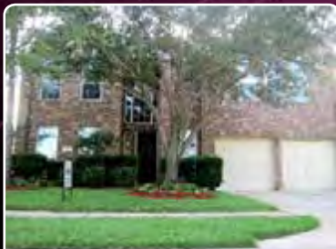
10107 Cottonwood Canyon ..... SOLD .....

INVENTORIES ARE AT RECORD LOWS. LIST YOUR HOME TODAY!