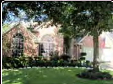
12118 W. Canyon Trace ..... PENDING .....