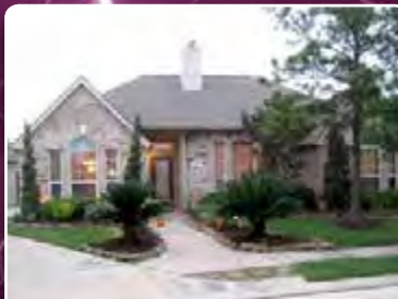
10143 Meridian Lakes Dr. ..... SOLD .....