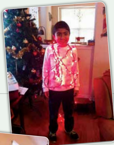
Yajat lit up!