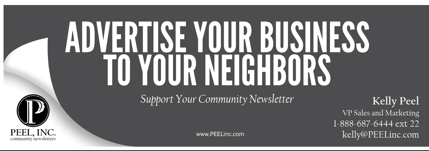
4 Woodland Hills Homeowner's Association Newsletter - January 2014

Remember: today's online calendars are more than digital date books. They're also productivity, time-saving and even habit-changing tools. So, if you are determined to get organized in 2014, turn over a new (electronic) calendar leaf. It may be the first New Year's resolution you ever keep.