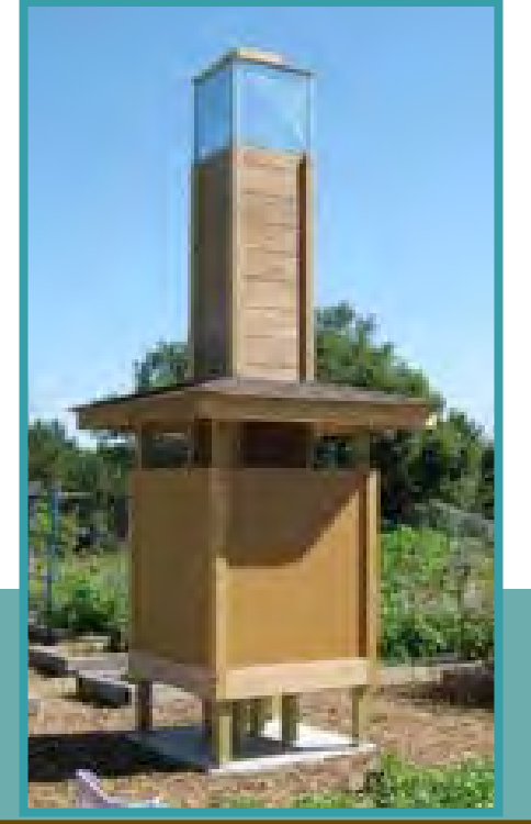
Legend Oaks - March 2014 5