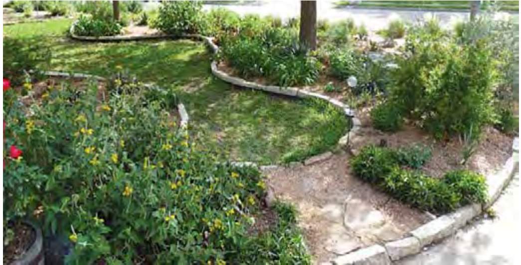
Example of a front yard xeriscape that would comply with Avery Ranch HOA xeriphytic guidelines.

To add to this theme, “Associa Green”, a program by Associa, our property management company, to help make our community members live a greener life that's good for both us and the earth will be on hand. We may have a visit by Daisy, the ladybug who should delight the children. Also participating will be the Travis County Master Gardeners who will have a gardening help booth to answer your questions and provide sound advice for water saving gardening. This has been very popular in past years. They will have copies of the newly revised and expanded City of Austin “Grow Green” book, a must have resource for every homeowner, as well as