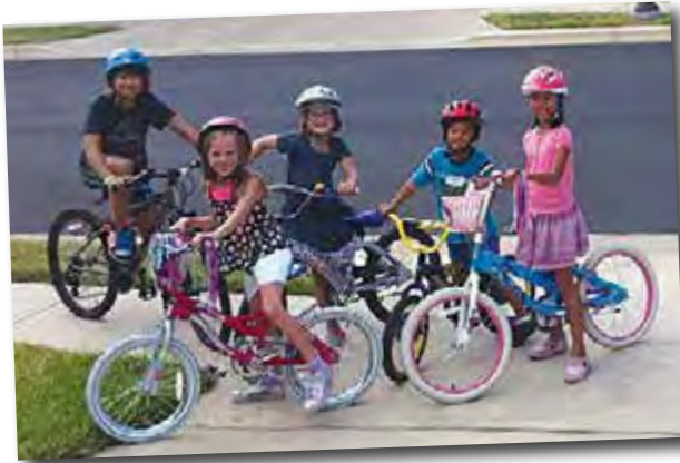
Some of the Reckless aBandon Crew (from Bandon Drive in Brookside)

Parents this is your chance to brag on your kiddos. We want pictures of your kids doing everyday things, school events, plays, sports, etc. Send in your pictures to be featured in the Home on the Ranch. E-mail your pictures to ARNEWS@AveryRanchHOA.com by the 8th of the month.