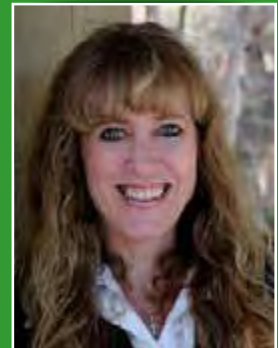
Resident of Eagle Springs