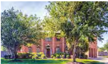
17419 Wild Rose Ct.

Lakes of Rosehill Almost 1 acre, 5 bedroom