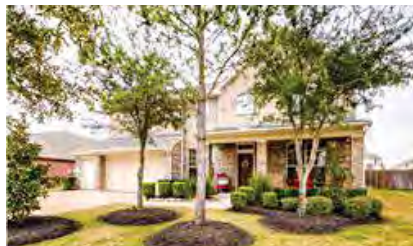
19519 Stanton Lake Dr.

Lakes of Rosehill Almost 1 acre, 5 bedroom