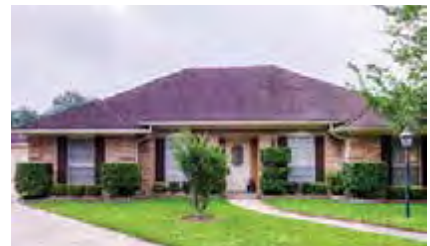
15602 Sandy Hill

Gates at Canyon Lakes West 5 Bedroom, Gameroom, & Media Room