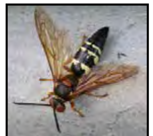
Fig. 2. Cicada killer.