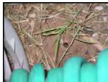
Fig. 1. Hole created by a cicada killer.