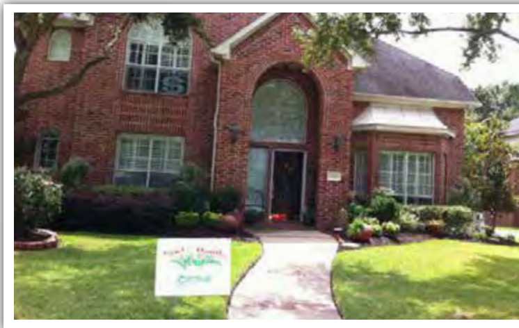
Honorable Mention: Michal & Amali Zreir – 12319 Lakes Shore Ridge