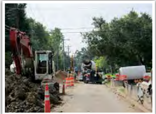
Construction landscape as of September 15th