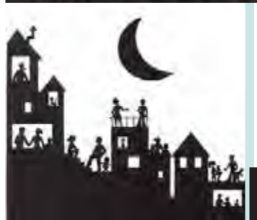
Turn on your porch light and join us at the Club House for Food, Fun, and Prizes!