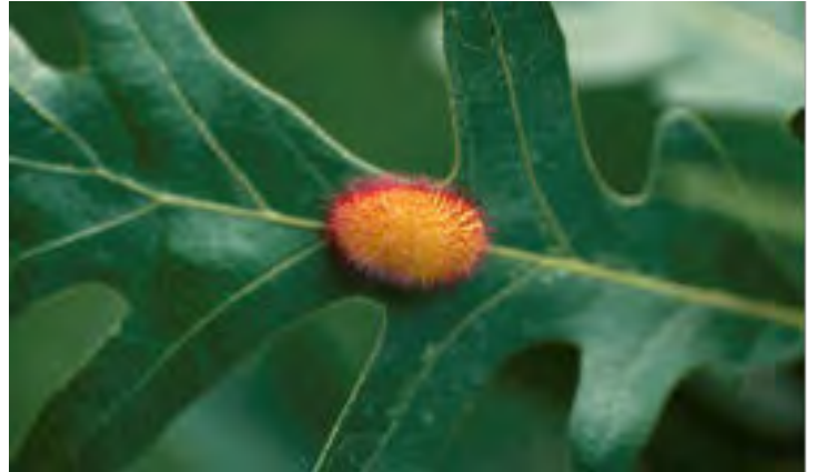
Hedgehog gall on white oak