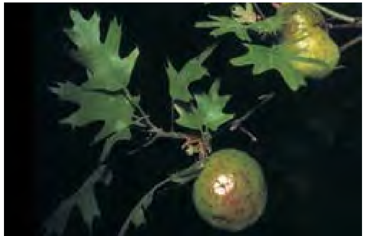
Hedgehog gall on white oak