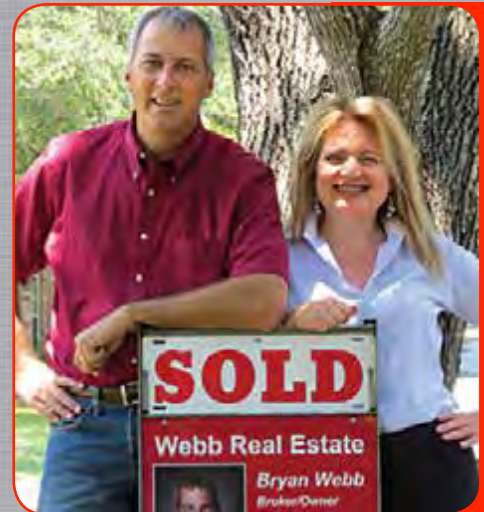
The Broker You Can Trust

! HOW TO SELL YOUR HOME VIDEO ! Watch at www.bryanwebbtx.com/swa