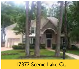
17372 Scenic Lake Ct.