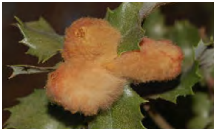
Hedgehog gall on white oak