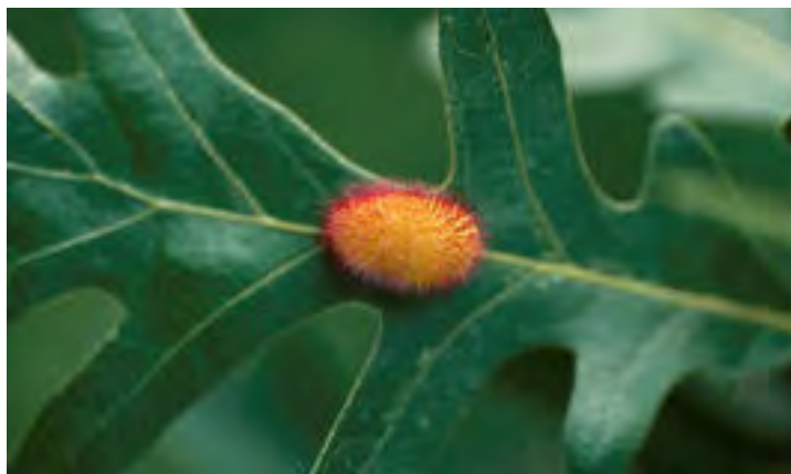
Hedgehog gall on white oak