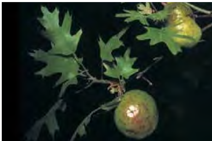
Hedgehog gall on white oak