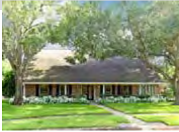
5235 LOCH LOMOND DR | $790s 3 BEDROOMS | 3 BATHS