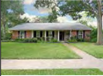
5322 YARWELL DR | $640s 4 BEDROOMS | 3 BATHS