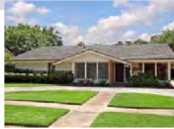
4911 GLENMEADOW DR | $520s 4 BEDROOMS | 3.5 BATHS