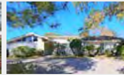
5238 N BRAESWOOD