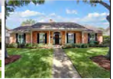
5610 JACKWOOD | $490s 3 BEDROOMS | 2.5 BATHS