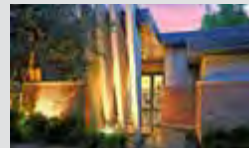
5006 N BRAESWOOD