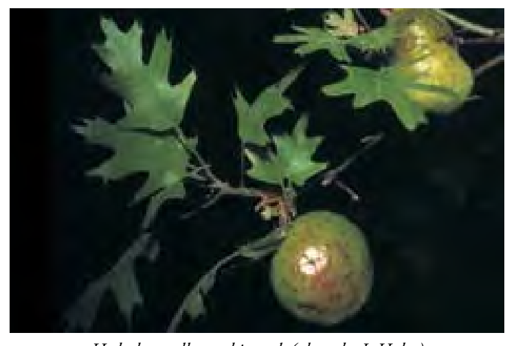
Hedgehog gall on white oak